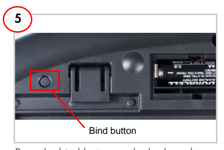
Press the bind button on the keyboard to bind it with the bridge. The mouse and keyboard work smoothly with the PC.