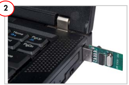
Connect the bridge dongle to the PC. The bridge enumerates as a HID device.