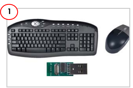
Unpack the CY4636 WirelessUSB™ LP RDK Bridge dongle, keyboard, and mouse from the package.