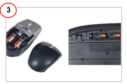
Power the mouse and keyboard with two AA batteries each.